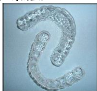
Special Order Soft Plastic